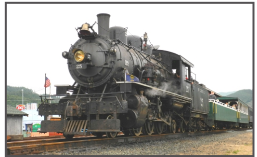
Featuring the McCLOUD RIVER RAILROAD No. 25