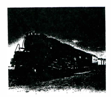
A Special Steam Excursion Train Powered by