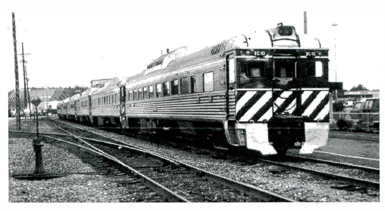
A six car Cariboo Dayliner sits in Vancouver BC. BC Rail still uses RDC's for passenger service. This train consist of three RDC-1s and three RDC-3s.

Rail Diesel Cars were an attempt at cost effective rail transportation in the waning years of passenger service. The New York Central bought the first RDC from the Budd Company in 1950; during the twelve years of RDC production, five different versions were manufactured, for a total of 398 cars on many US and foreign railroads.