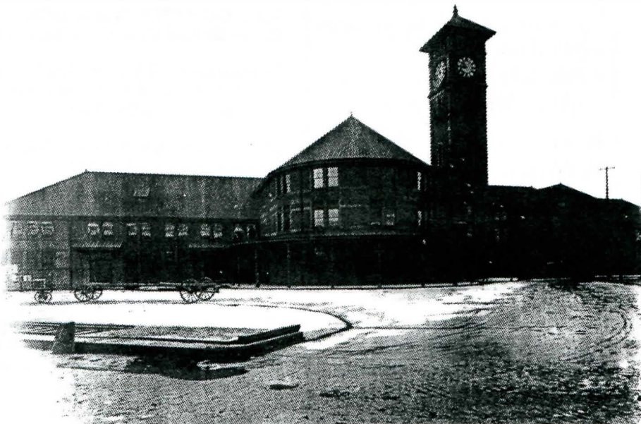
Union Station as it looked soon after completion. The temporary baggage shed has not yet been built.

Union Station, originally planned as the "Grand Union Depot," was designed by the architectural firm of Van Brunt and Howe, but this was in 1890, after the initial design by the firm of