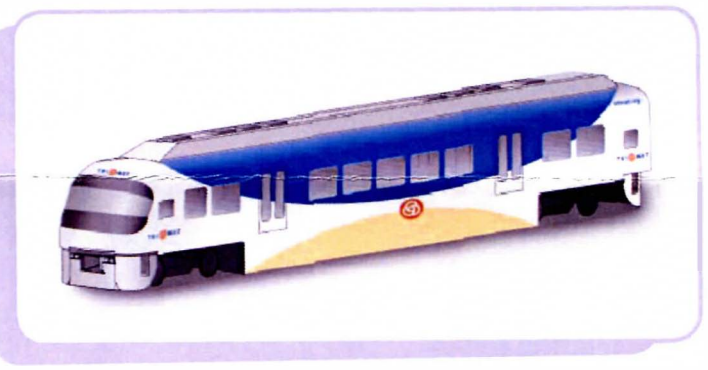
TriMet purchased five diesel multiple unit rails vehicles from Colorado Railcar.

Planners project that by 2020, the travel time between Beaverton and Wilsonville by car will take 40 minutes compared with 27 minutes via Commuter Rail.