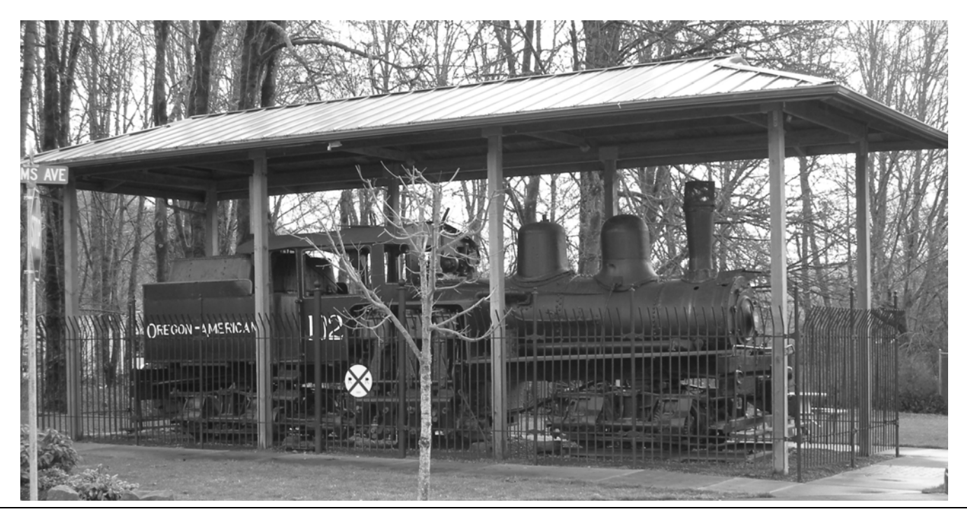
March 2008, Pacific Northwest Chapter, National Railway Historical Society, The Trainmaster page 7

The community of Vernonia Oregon is still struggling to recover from the disastrous flood of early December however the #102 Shay locomotive on display in downtown Vernonia seems to have survived.