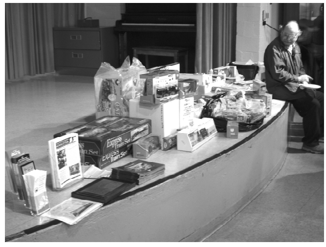
2007 Train Toys for Tots is a success.