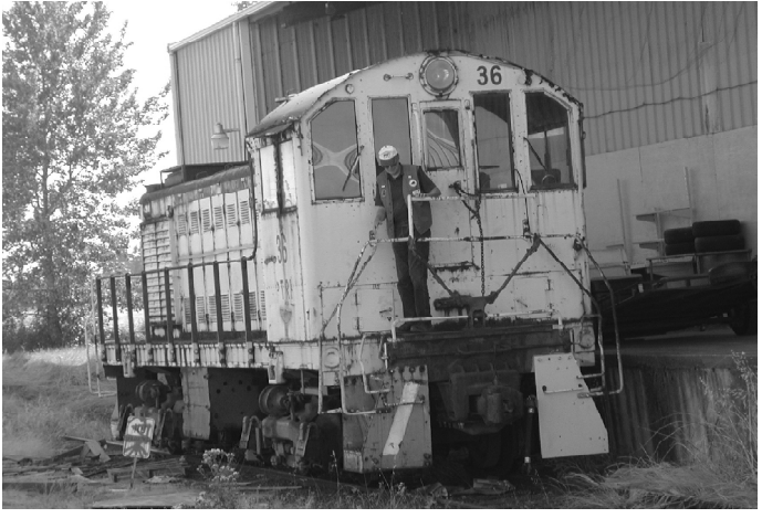
The S2 #36 is moved closer to Powerland.