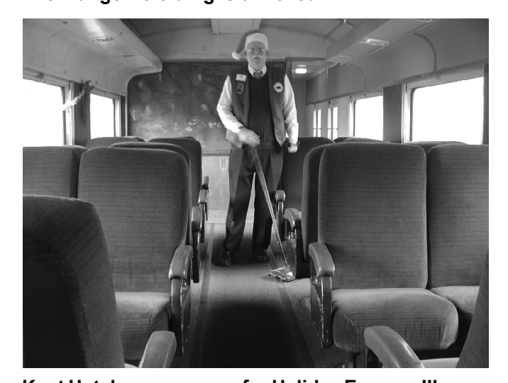
Kent Hutchens prepares for Holiday Express III.