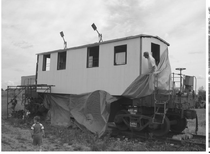
The Flanger re-siding is unveiled.