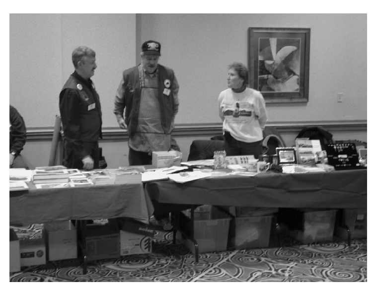
SP&S Swap Meet Sales Team at the Holiday Inn.