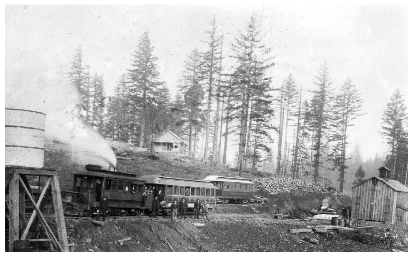
Page 10 Sept.2009 Pacific Northwest Chapter National Railway Historical Society The Trainmaster

This 1890's view shows the West Portland terminal of the City and West Portland Park Railway. Visible in the photo are two of the line's coaches and an 0-4-2t steam dummy. The coach body was often applied to urban steam locomotives of the period in an attempt (generally unsuccessful) not to scare horses.