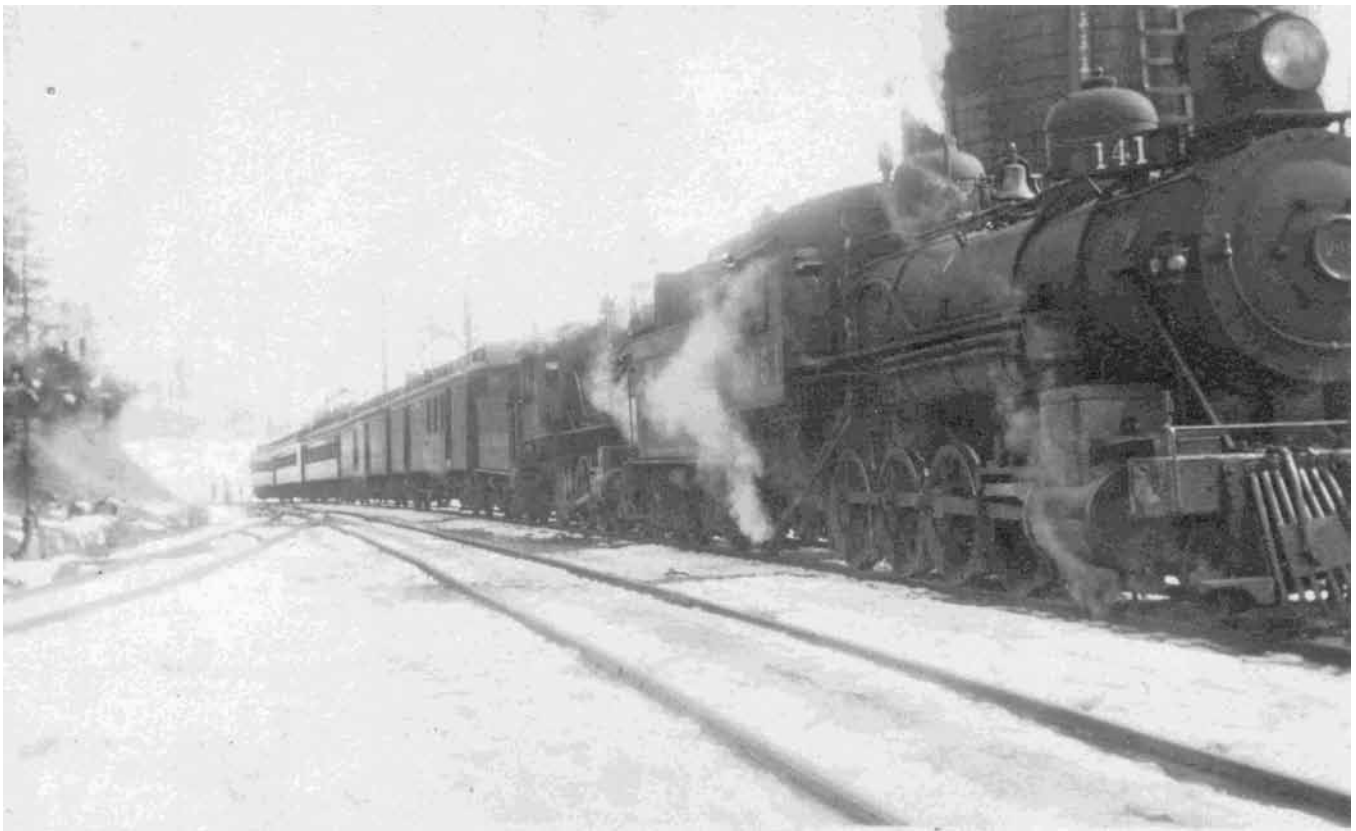
In 1921, the photographer caught train 141 at Cochran, Oregon. The 4-8-0 was built by Schenectady in 1892 and spent the last years of its operation leased to the Northwestern Pacific. The locomotive finally met the scrapper's torch in 1952.

Train” arrived each Friday afternoon carrying Portland men who, after working in the city all week, would join their vacationing families. The railroad’s legacy in Rockaway Beach is obvious in the red caboose that houses the Rockaway Beach Chamber of Commerce at the Wayside.