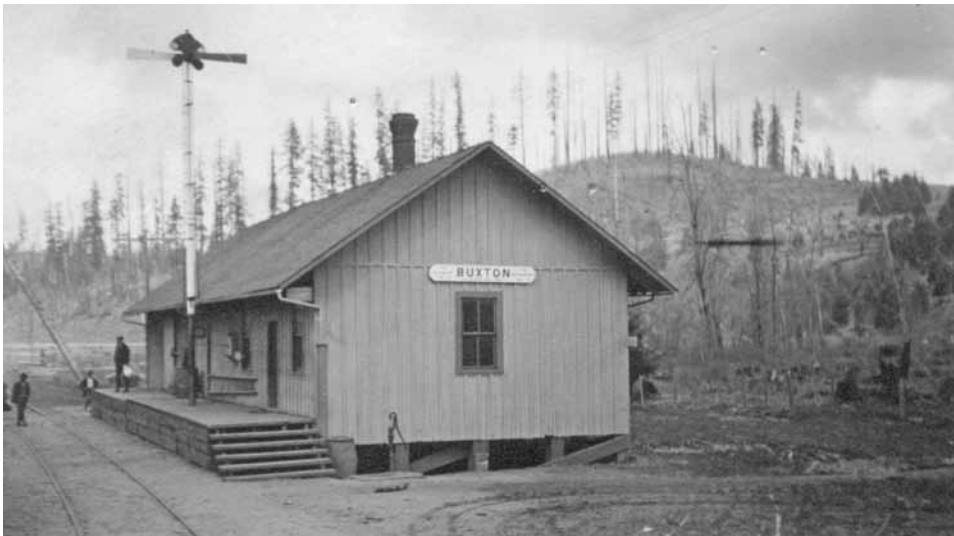
The Buxton depot certainly would not have won any architectural awards, but it provided rail access to a small community which, 100 years ago, was far from the civilization of Portland.

Despite its burgeoning fishing and agriculture industries, Tillamook County finally attracted the attention of serious railroad investors when word of prime, old growth timber began to spread.