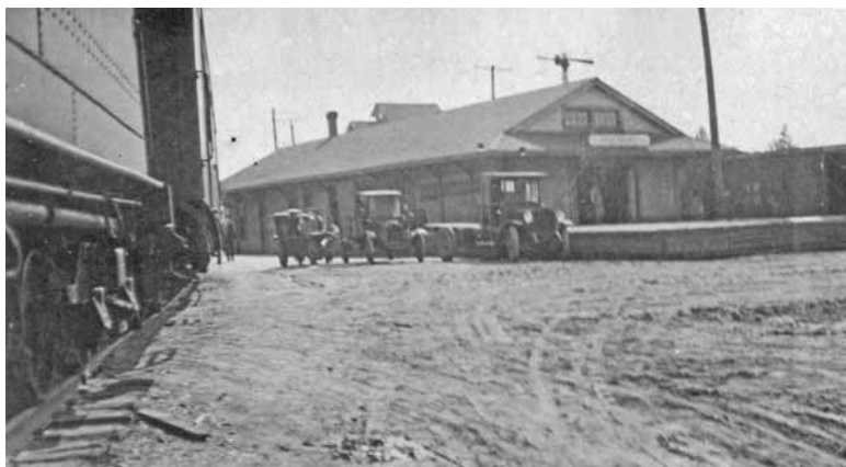
There seems to have been a fair amount of freight traffic at the Hillsboro station when this photo was taken in the 1920s. That's train 141 on the left.

The significance of the introduction of a railroad to the area is apparent in the name of the unincorporated north Tillamook County community of Mohler, formerly known as