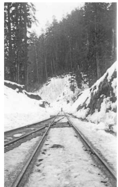
This view of the vacant trackage at Wedeburg shows that the Tillamook line received its share of snow in the winter. The high elevation of the railroad over the hills to the coast resulted in much inclement weather.

Further south, the railroad spurred tourism in Rockaway, where the “Daddy