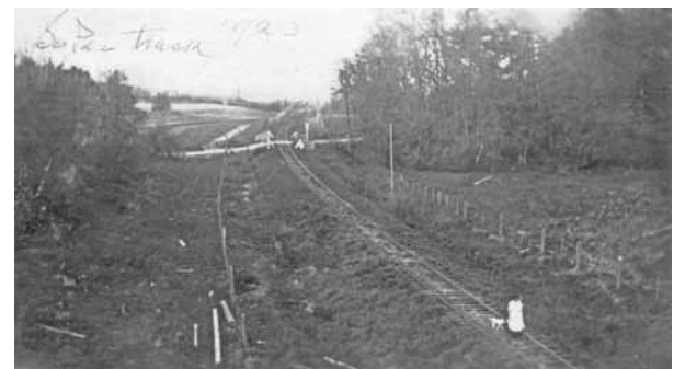
This trio of photos, probably all taken during the 1920s, show the Banks depot and the rail line just outside of Banks. It appears that there should have been a bit more aggressive weed control on the railroad.