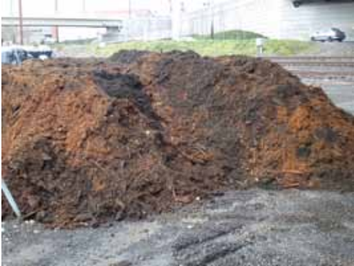
Left: The drop pit excavation shows the woody debris which underlies the site, a leftover from the sawmill that occupied the area previously. The material shows little decay and is unsuitable for a foundation. The building has to be constructed on piling. (January 30 photo by Arlen Sheldrake)

The Oregon Department of Transportation's Martin Luther King Boulevard viaduct on 99E in SE Portland provides an excellent viewing platform to watch the progress of the new Oregon Rail Heritage Foundation engine-house facility near the Oregon Museum of Science and Industry. Building completion is targeted for late June. There are lots of free parking spaces under the south end of the viaduct with an easy walking ramp up to the top. While you're there, be sure to check out the pictures in the four viaduct kiosks.