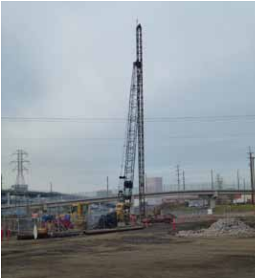
Left: A large pile driver was brought in because the company's smaller one was unavailable. (December 14 photo by Arlen Sheldrake)