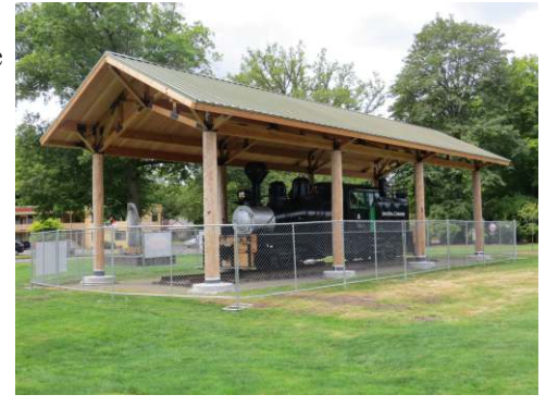
Long-Bell Shay Pavilion

The Oregon Department of State Lands August 18th announced the removalfill permit for the Covote Island Terminal at the Port of Morrow in Boardman was rejected. The state agency said despite a two-year review, Australia-based Ambre Energy hadn't done enough to analyze alternatives that would avoid harming tribal fisheries at the Port of Morrow in Boardman,