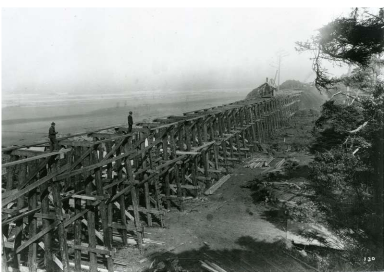
soldiers must have felt as they hacked and grubbed No.130 several large trestles. Today's Hwy. 101 in atop the old grade.

From this point, we drove westward, along Yaquina Bay Road, headed for Newport. alignment of the existing road is on top of the old railroad all the way into town. We had several photos with us that depicted the construction of this portion of the route and we got into a discussion of what those North of Newport the YN crossed numerous stream that required the building of the way towards Newport, building the railroad.