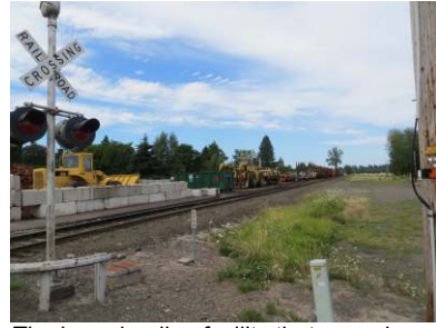
The log reloading facility that occupies a former mill site

AERC, under contract with Teevin Brothers of Rainier, developed the