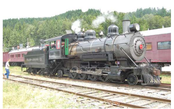
Polson Logging Co. 2-8-2 No. 70