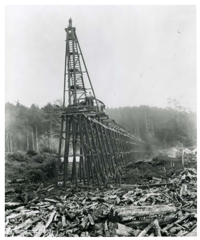
Surrounded by beach logs, one of the large trestles is being built along the coastline north of Agate Beach. Clark Kinsey No. 112

The grade crosses to the west side of Highway 101 at this point and continues northward on a rather serpentine route. The construction of a new development called Meritage at Little Creek has obliterated anything that might have still existed at that location. The grade then crossed Little Creek, the north end of the structure having been located about the entrance into the Little Creek Cove Condominiums.