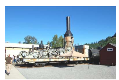
"The Unit" combination loader and skidder