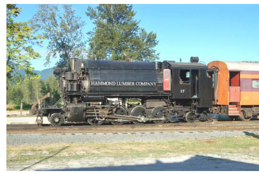
Newly overhauled Hammond Lumber 2-8-2T No. 17