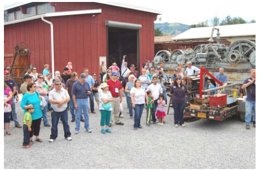
The Visitors for the day

The following photos from the July 19 "VIP" day at Mt. Rainier Scenic, which featured the dedication of the new facilities, most which were moved from the former Camp 6 near Tacoma.