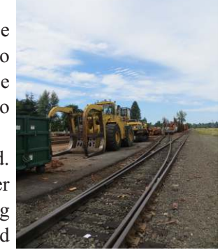
Another view of the log reloading site

Seems AERC didn't get any permits to develop the Crabtree reload facility and the neighbors had gotten used to living next to a long defunct lumber mill. With the urging of some Crabtree residents, the Linn County Commission went to Federal court to force AERC to go through the county permitting process.