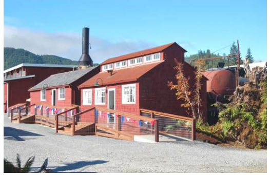
Some of the new buildings. One will feature a future theater.