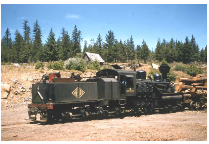
Medco No. 4

the Medford Railroad Park and just recently, title was transferred to the Society. Unfortunately, much of the easily removable hardware and "jewelry" was removed from the engine since its retirement and it looks just a bit incomplete. However, all of the major parts are intact and work is underway to restore No. 4 to operating condition for use on a proposed excursion railroad above Butte Falls.