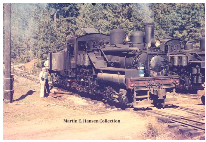
Medco No. 4

This locomotive hauled logs out of the woods above Butte Falls until 1962 when the railroad logging operations of Medco were taken over by truck. No. 4 was then donated to the City of Medford for display in Jackson Park. In 1986 it was moved to