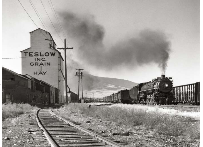
SP&S 700 Steams past Teslow Elevator in Livingston, Montana

SP&S No. 700 steams past the Teslow elevator in Livingston, Montana eastbound to Billings, Montana on October 14, 2002, photo taken and copyright by J.P. Bell Photography. J.P. Bell Photography has photographs from the Ozark Mountains, American West, and beyond. Galleries are available to make it easy for visitors to obtain exhibition prints from a wide range of subject matter. The photographs are printed on archival acid free paper. J.P. Bell also grants licensure of images on this website for use in brochures, annual reports, and other special applications. <a href="https://www.jbbellphotography.com">www.jbbellphotography.com</a>. This photograph is used with the kind permission from J.P. Bell for publication in this and only this Trainmaster newsletter.