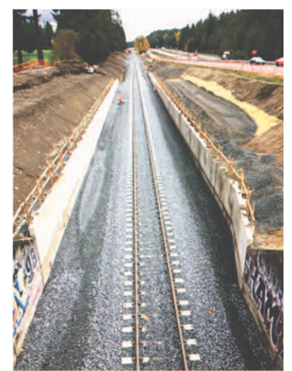
Looking east toward DuPont from the Mounts Road car bridge.

Looking east toward DuPont from the Mounts Road car bridge. New track is in place and retaining walls are being completed.