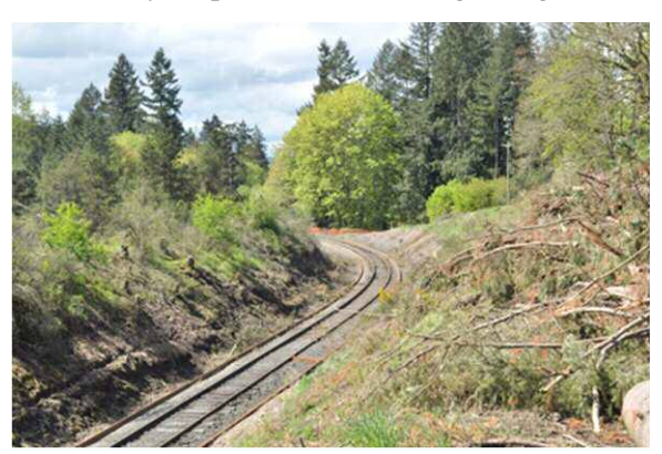
The Start of Construction

I thought Members might be interested in seeing some of the pictures I have taken over the past two years. These photographs were take along I-5 near the community DuPont, WA located about ten miles south of Olympia, WA. The rail line runs parallel to I-5 in this area. About a half mile west of DuPont it turns south and crosses I-5 running into the Nisqually Valley to meet the BNSF and Union Pacific rail lines in the Nisqually Valley. I-5 runs east-west at this location not the usual north-south direction many of us are used to. It can be confusing because most of the time objects alongside I-5 are either on the east side or west side. Here they are on the north side or south side. The pictures were taken over one and a half year period from the beginning of construction until the rail lines were near completion.