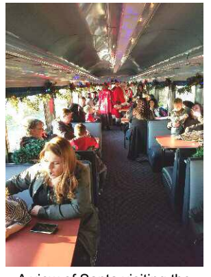
A view of Santa visiting the guests in the Round End Car