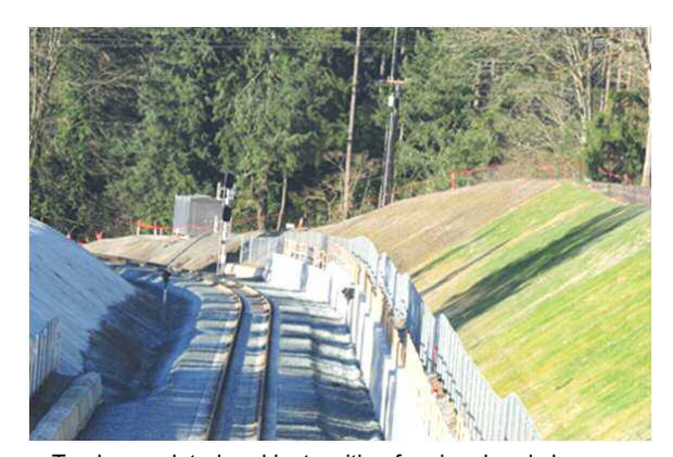
Track completed and just waiting for signal and clean up completion.