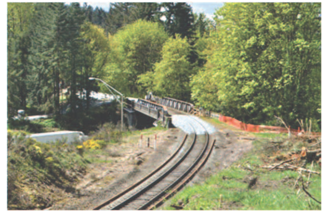
The I-5 bridge being refurbished

Closer view of the rail line bridge reconstruction. This was where I first got my "No, no, no Holy Jumpin Up and Down