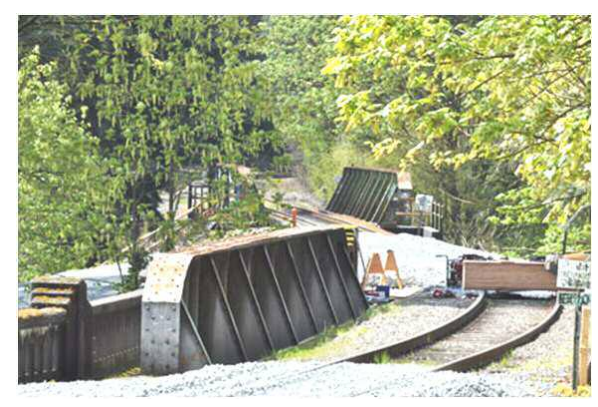
Closer view of the rail line bridge reconstruction

I was excited the morning of the first run. Two years of waiting was over. I went to the New Depot open house on December 15th. Now I planned to be on the Mounts road bridge on the first run. But it was dark and rainy so decided