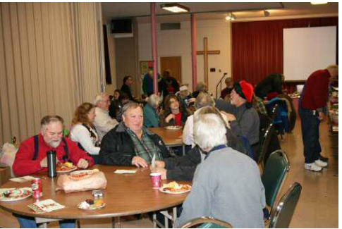
Folks Enjoying the Annual Potluck