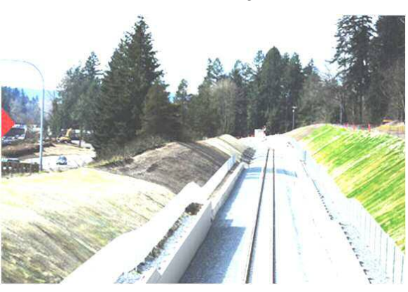
Looking west with new track, retaining walls and fence in place

to wait until later. I was reviewing the train schedule for a better time to take the long-awaited pictures of the train passing under the Mounts road bridge when my visiting daughter said, "Dad the train derailed onto the highway". One more time my No, no, no moment came true.