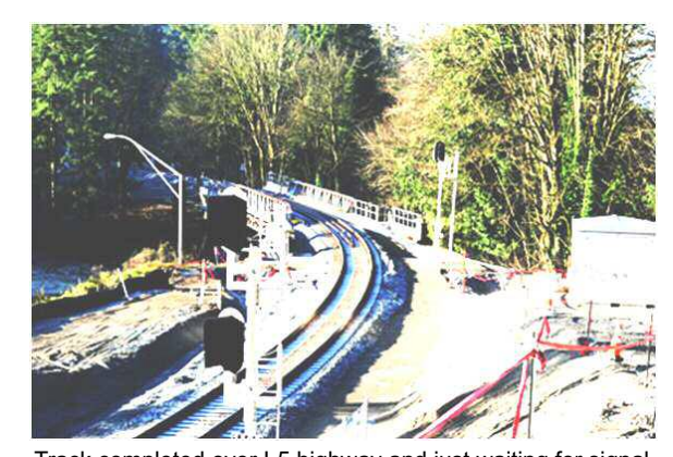
Track completed over I-5 highway and just waiting for signal and clean up completion.

REMEMBRANCE Quite a few of the people who boarded Amtrak Cascades Train No. 501 on December 18th for the maiden southbound run were railfans. And when the train crashed off the newly refurbished rails south of Tacoma with 77 passengers aboard, at least two of the three people who were killed in the accident came from the railfan world.