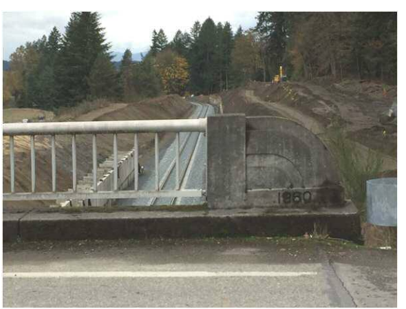
Picture from Mounts/Old Nisqually bridge west of DuPont. Bridge was built in 1960.

to wait until later. I was reviewing the train schedule for a better time to take the long-awaited pictures of the train passing under the Mounts road bridge when my visiting daughter said, "Dad the train derailed onto the highway". One more time my No, no, no moment came true.