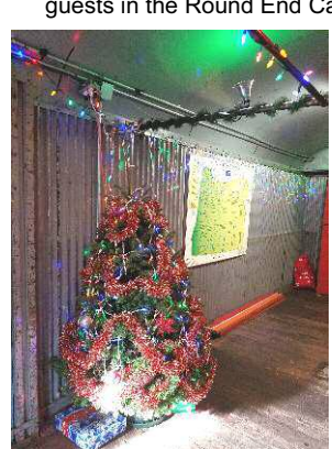
One of the Trees aboard the Baggage Car, with the Oregon Rail Historical Map in the background