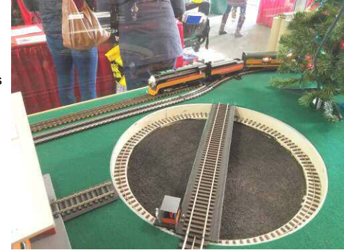
Ron Nierenberg created this display promoting the upcoming ORHC Brooklyn Turntable project