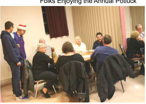
Folks Enjoying the Annual Potluck