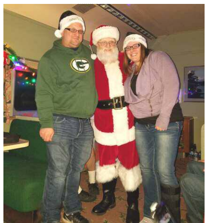
A Visit with Santa

Wow, we got through 72 train rides on the 13th annual Holiday Express in 2017 spread over four weekends! The volunteers from the Pacific Northwest Chapter as well as the other member organizations from the Oregon Rail Heritage Foundation hosted over 14,660 ticketed guests and passed out more than 15,000 Candy Canes (and what are those made out of again?). What a holiday accomplishment for our volunteers!!! And there was lots going on at Oaks Park - people were guided safely to & from the parking lot and across streets to the train, passengers were loaded and unloaded, cars cleaned, guests entertained & souvenirs sold in the decorated tent, volunteers feed and trains kept to the scheduled departure times (even with sometimes interesting cold and rainy weather!). Many heartfelt thanks to all of the volunteers for giving their time and enthusiasm to Holiday Express 2017. Without their hard work, attention to customer service, and for their smiles, we would not have the SUCCESS we realized again this year.