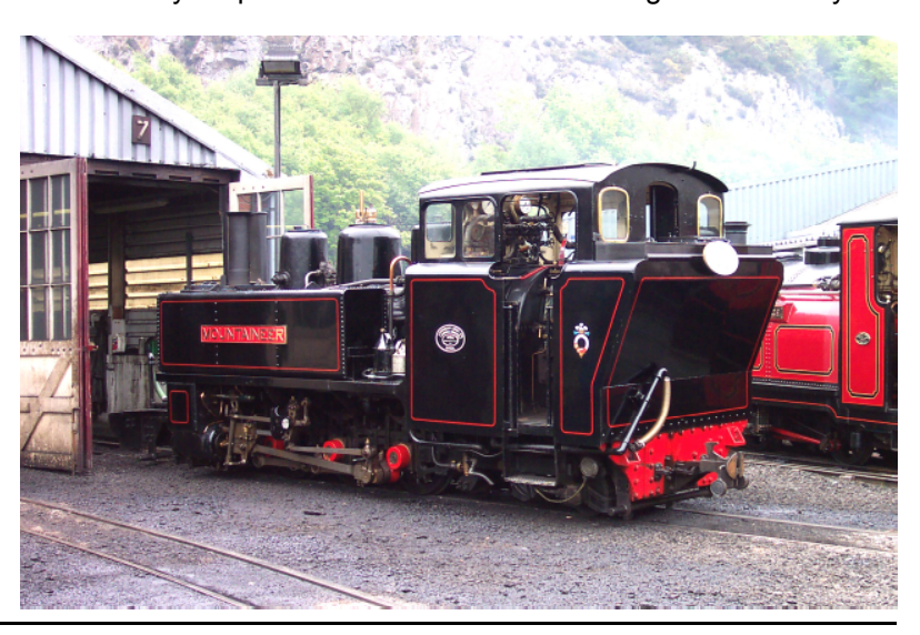
Page 6 Feb. 2010 Pacific Northwest Chapter National Railway Historical Society The Trainmaster

Left and below: The Mountaineer is an Alco Cooke 2-6-2T built in 1916. Originally constructed for the front lines of WWI as a trench locomotive, the Patterson, New Jersey product has seen much rebuilding in her nine-plus decades of service. The Mountaineer is currently out of service on the Ffestiniog Railway, awaiting boiler work. In the recent past, she had the distinction of hauling trains on the newly reopened sections of the Welsh Highland Railway.