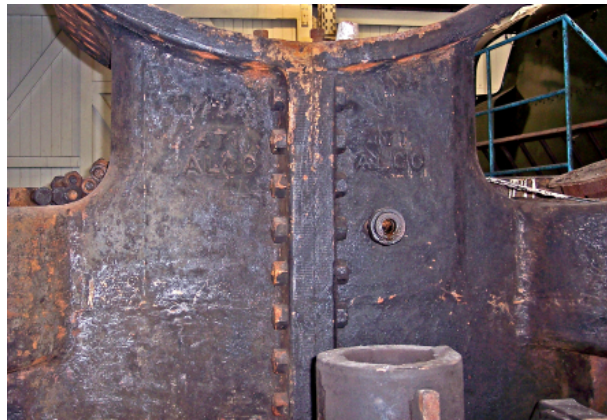
Brought back to Britain, the locomotive was christened Big Jim on the K&WV and was one of the mainstays of their fleet. Now undergoing a complete rebuild, the #5820 is expected to be back in service in the Yorkshire hills in the relatively near future. Despite the fact that the loco was outshopped by Lima, the cylinders clearly show Alco casting marks, a testament to the interchangeability of parts between manufacturers.