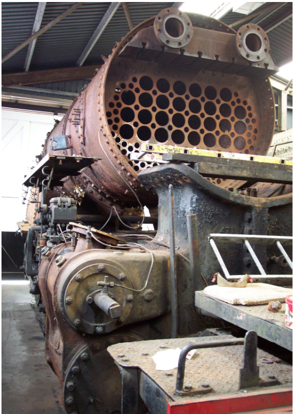
Above, and right: In the heart of Bronte country is the Keighley and Worth Valley Railway. Their #5820, 2-8-0, is an ex-GI Gypsy Rose Lee (stripped and ready for action) Consolidation that originally went to Poland.