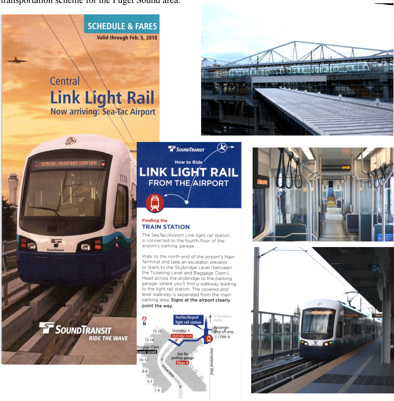
Page 8 Feb. 2010 Pacific Northwest Chapter National Railway Historical Society The Trainmaster

As the light rail is extended, and connections to other areas improve (such as to the University of Washington via the South Lake Union Streetcar ), this will become a valuable segment in the overall transportation scheme for the Puget Sound area.