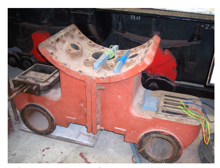
Left, above, and below: Scarcely more than a collection of parts, this Baldwin tank 4-6-0 now resides at the Welsh Highland Railway in Porthmadog. The locomotive was brought to Wales from India (#794) as an example of a Baldwin 4-6-0T (#590) that once operated on the Welsh Highland. A fund drive is underway to restore the locomotive to operating condition.