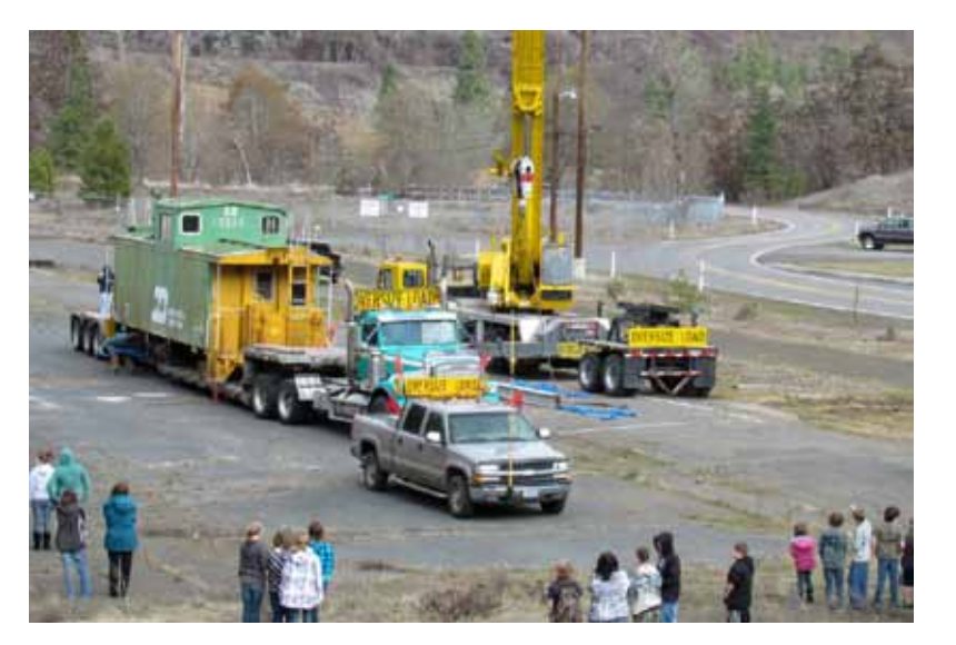
Above: The caboose arrives in Klickitat on a lowboy supplied by Redmond Heavy Hauling. Left: The caboose was carefully lifted from the lowboy and placed on its trucks. Accurately dropping a railcar on its centerpins is no easy task.

in Klickitat remained open until July 1994, but they had switched from rail to trucks by 1992, making the Lyle to Klickitat stretch obsolete.