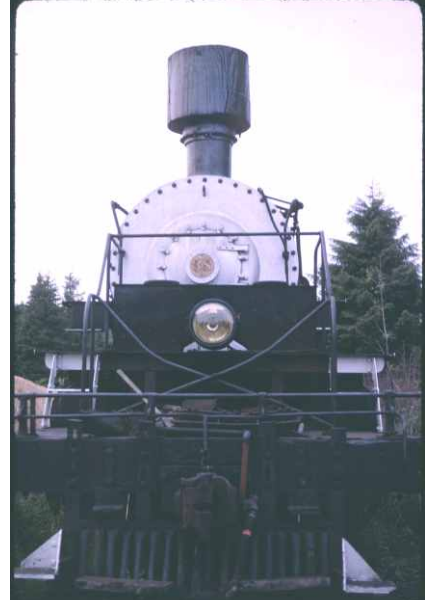
June 22, 1985: View of the front end of steam locomotive No. 38 at Rayonier Incorporated's railroad camp. Possibly part