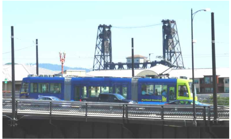
Portland Streetcar testing on the Broadway Bridge Ramp

The Portland Streetcar is excited to open its newest line, the Central Loop, on September 22, 2012. The celebrations will start at 10:00AM with a Press Event and speeches at the OMSI Plaza in SE Portland. Service will begin by 11:00AM following the press event and the departure of the first, ceremonial train. The Central Loop will