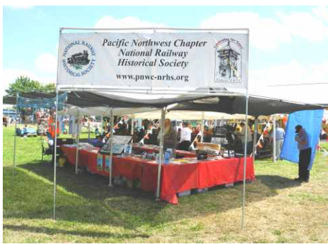
Overview of the PNWC Concessions area at Powerland