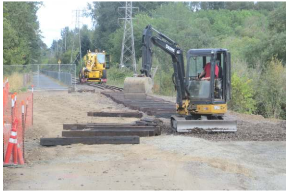
OPR Crews Laying New Track

During the closure, OPR stationed their passenger cars and