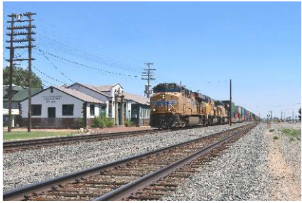
Depot and Westbound Intermodal