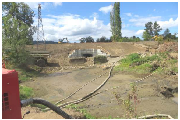
The New Culvert

During the closure, OPR stationed their passenger cars and