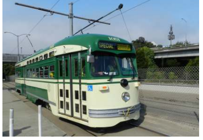
Cars at the Muni Shop

All other street lines use light rail equipment. Most, if not all, of the other lines use the